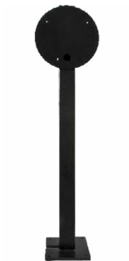
Fig. 1 - Freestanding mount shown with Pod Point solo unit mounted on it.